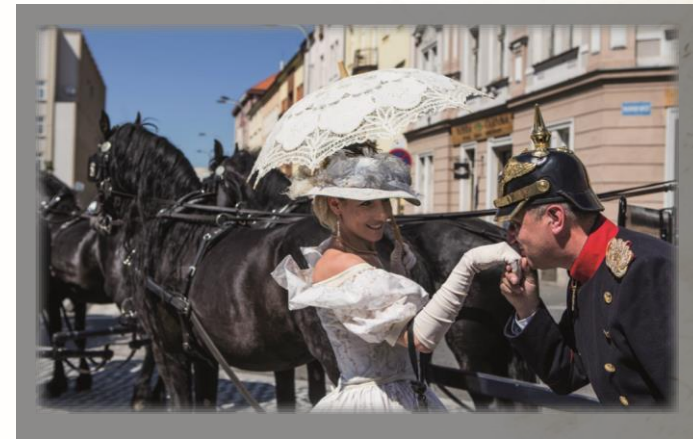
„Benedek“ theatre performance during 2016, Střezina Primary School of Art in Hradec Králové